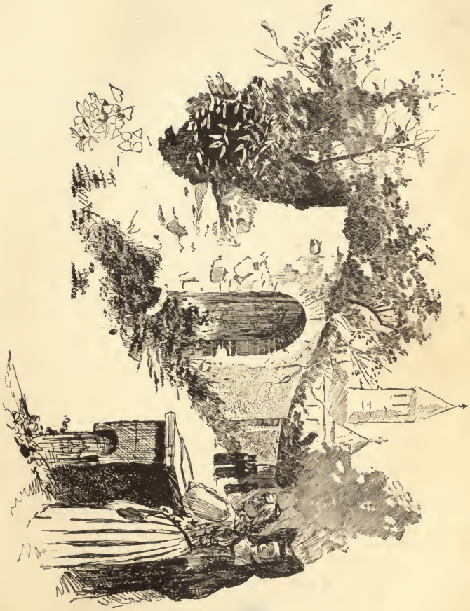
"SANDY WAS WORN OUT WITH NURSING."